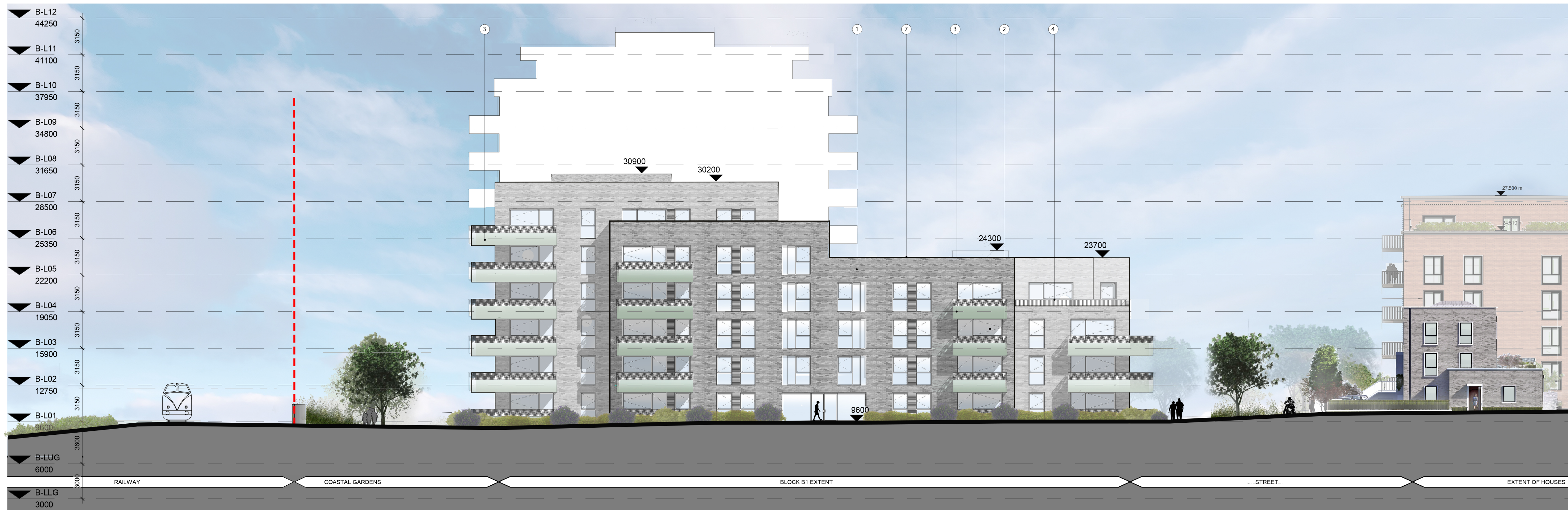
Block B - North Elevation