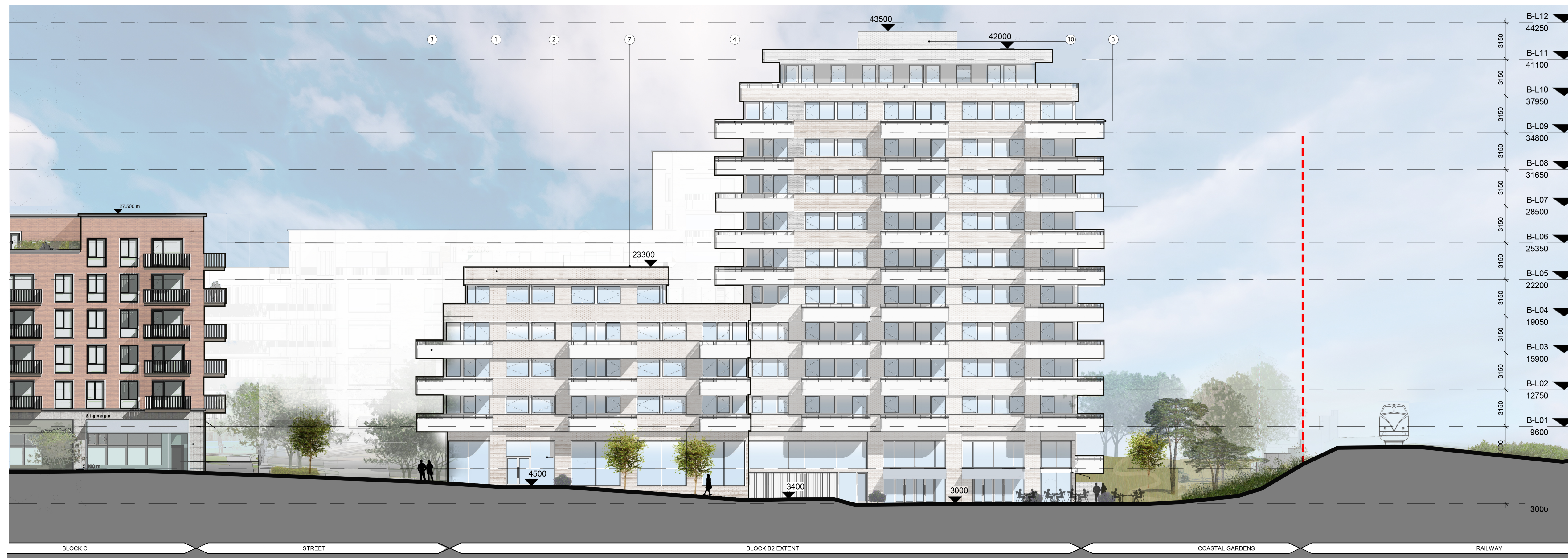
Block B - South Elevation